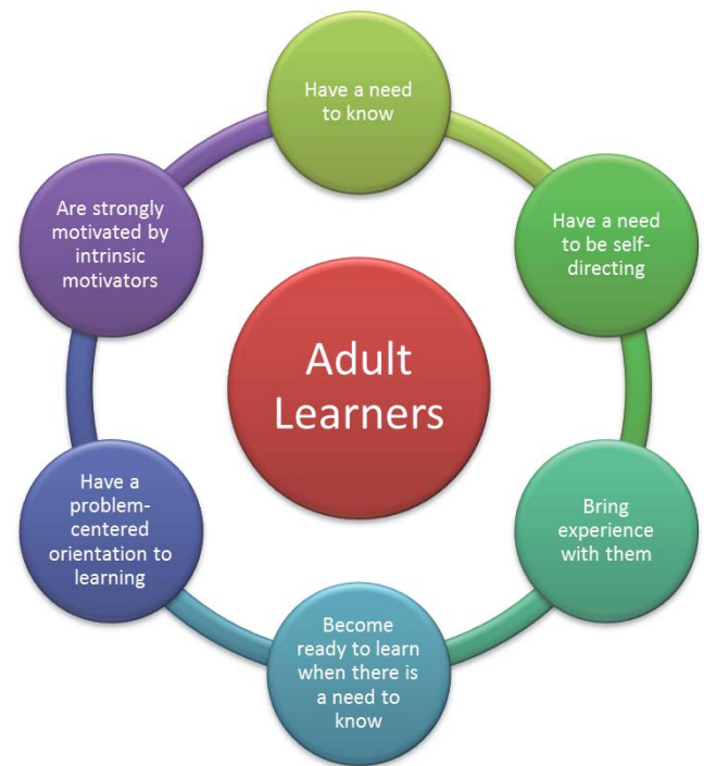
Figure 2. Six assumptions about adults as learners [25]