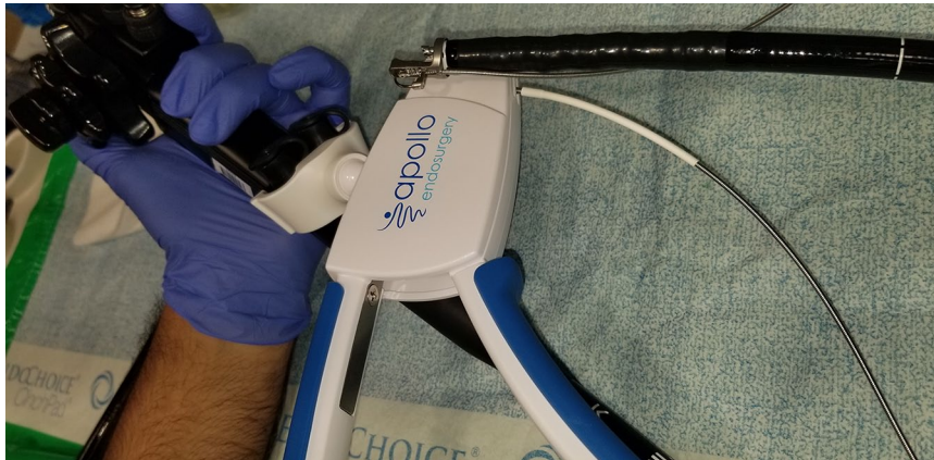
Figure 3. AspireAssist® Weight Loss System.